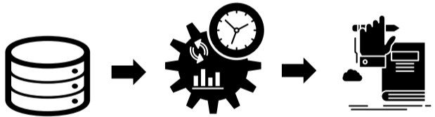
Data Mining Process

Data mining refers to the process of extracting information and knowledge from a mass of important data.