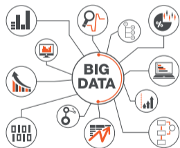
Figure 2: Big data 2

The rapid expansion of data in many fields lead us to deal with an immense volume of data that should be analyzed in order to extract knowledge and information, in industry, economy, scientific discoveries, etc.